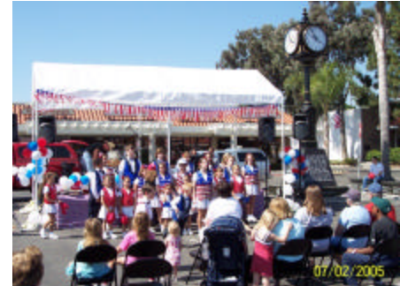
Photos (left to right): Cannon Wall/Slope Failure; Children's Parade at Red, White and Blue Summerfest; Celebration USA and crowd on July 2nd.